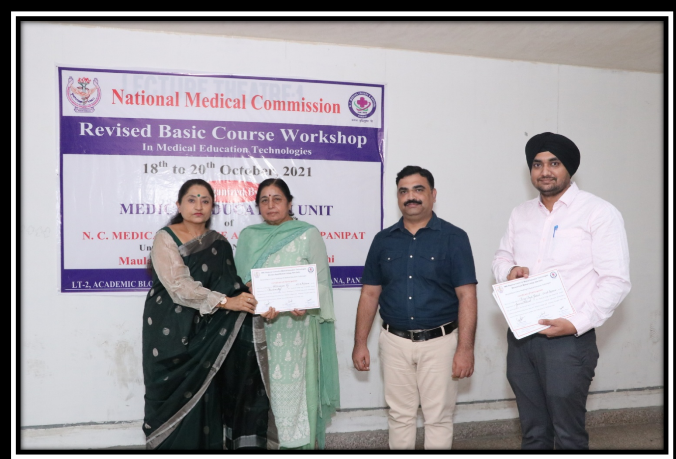
Page 13 of 10