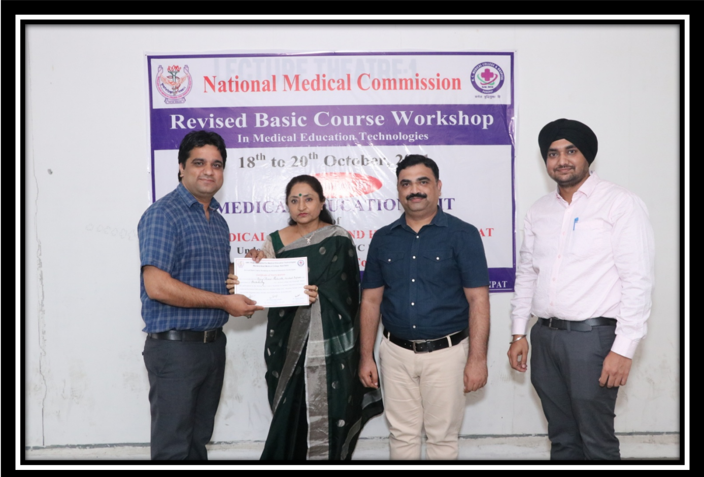
Page 27 of 10