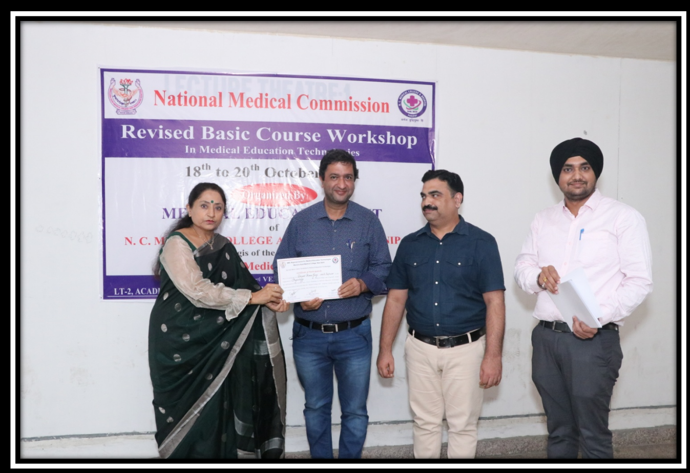
Page 16 of 10