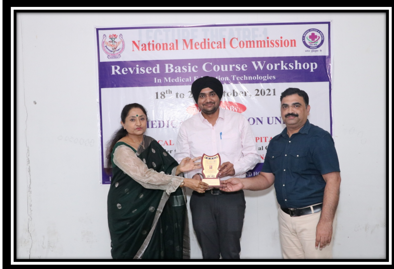
Page 31 of 10