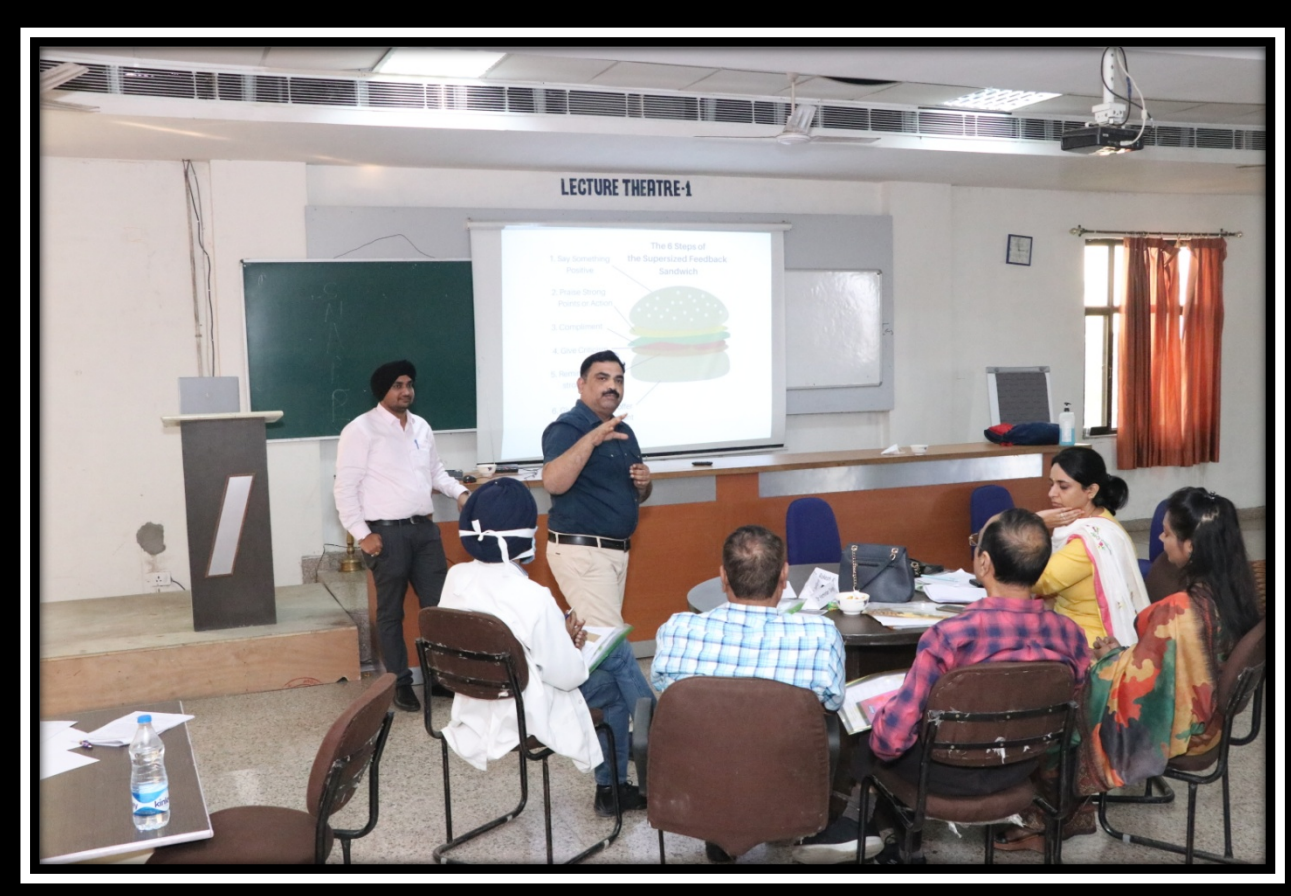
Page 11 of 10