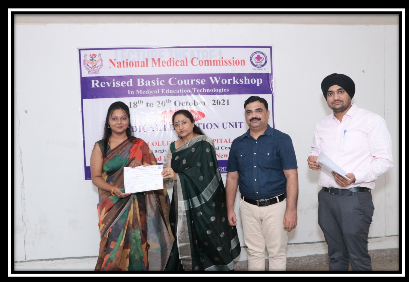
Page 20 of 10