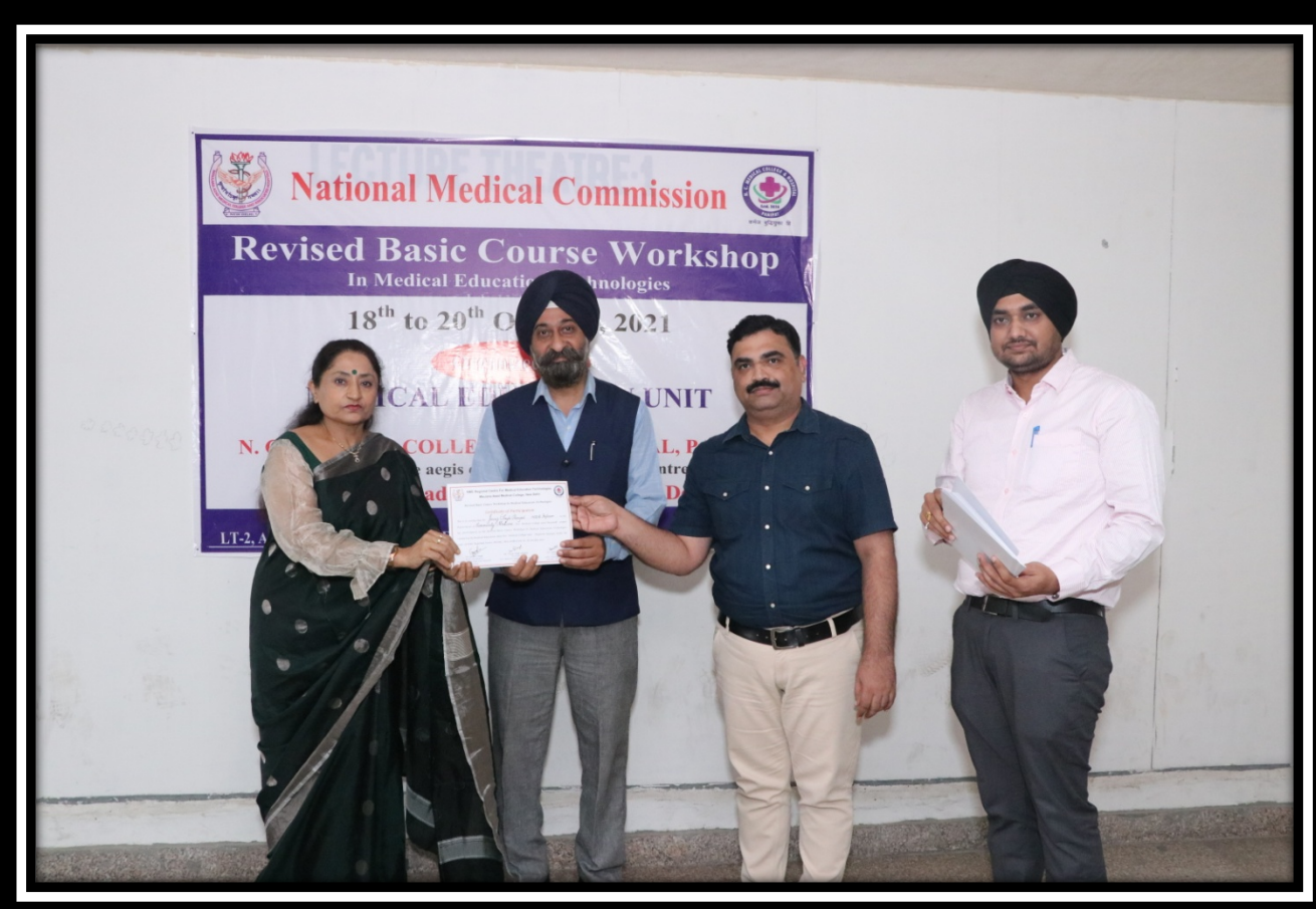
Page 15 of 10