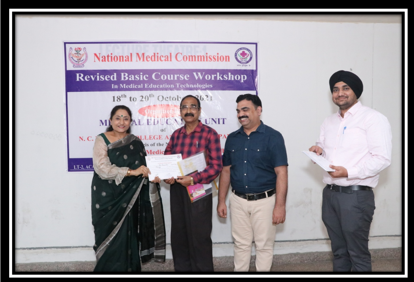
Page 14 of 10