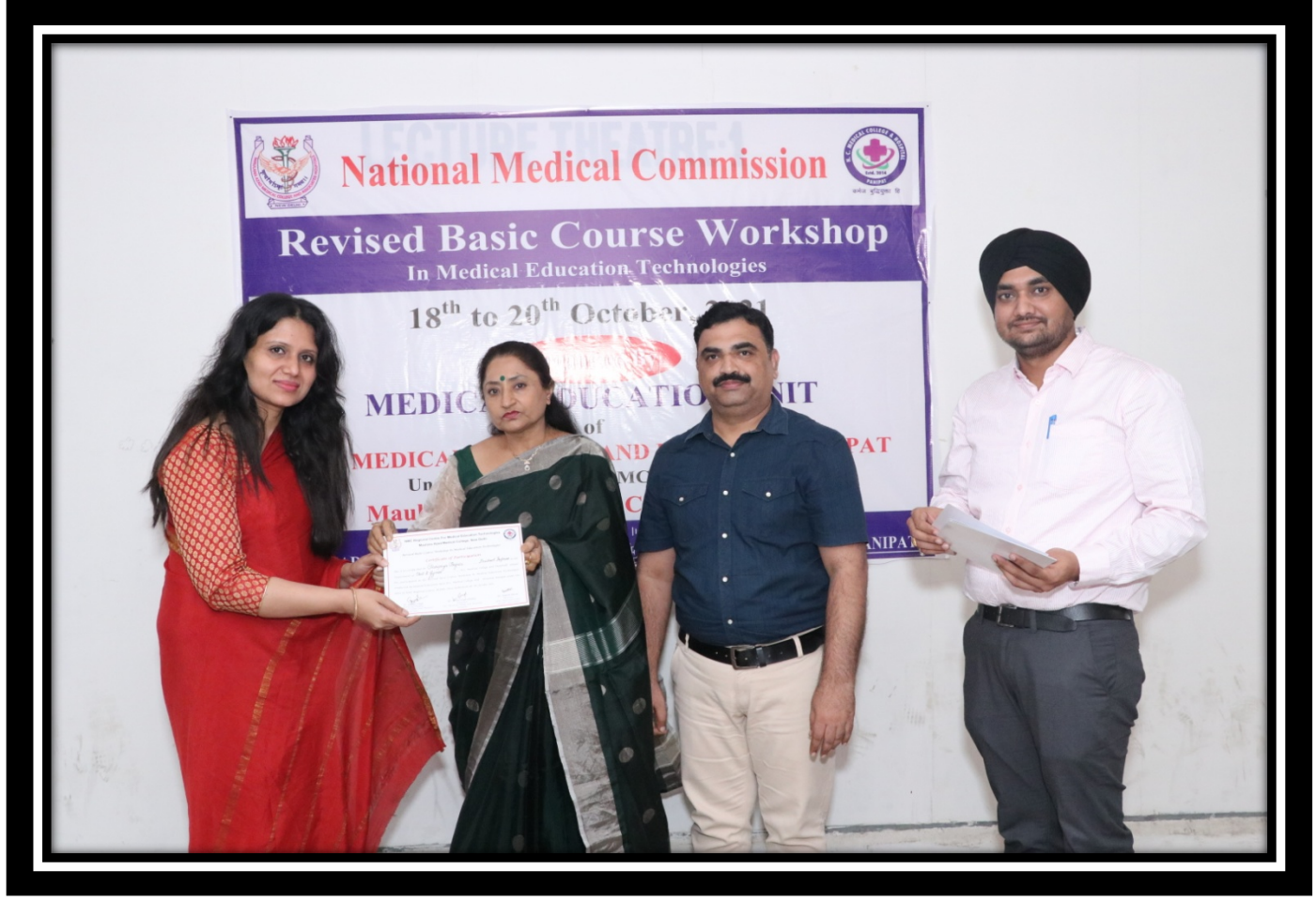
Page 25 of 10