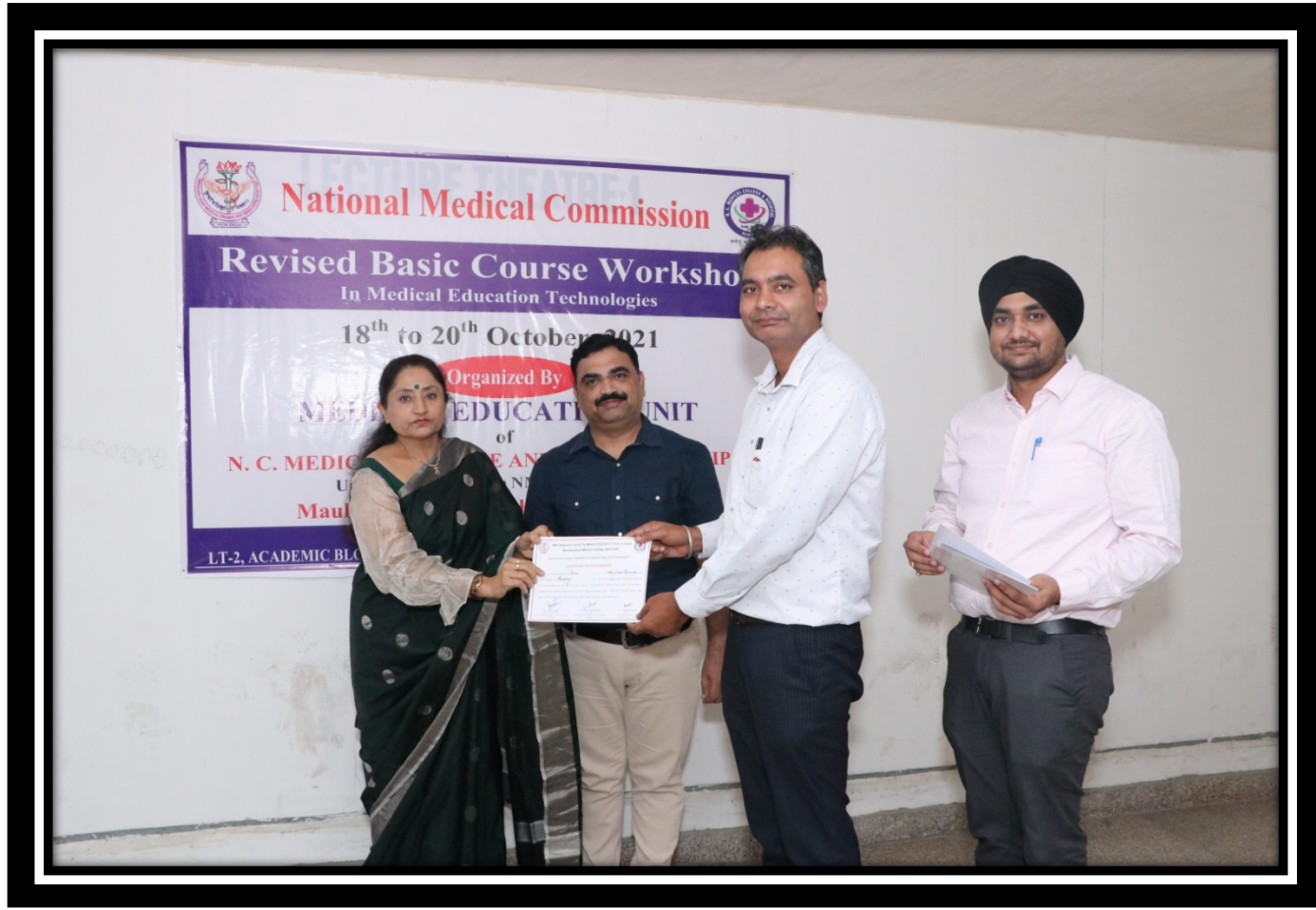
Page 24 of 10