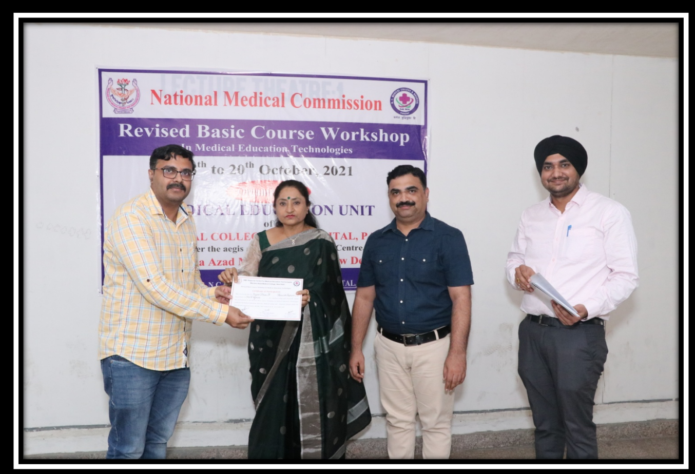
Page 18 of 10