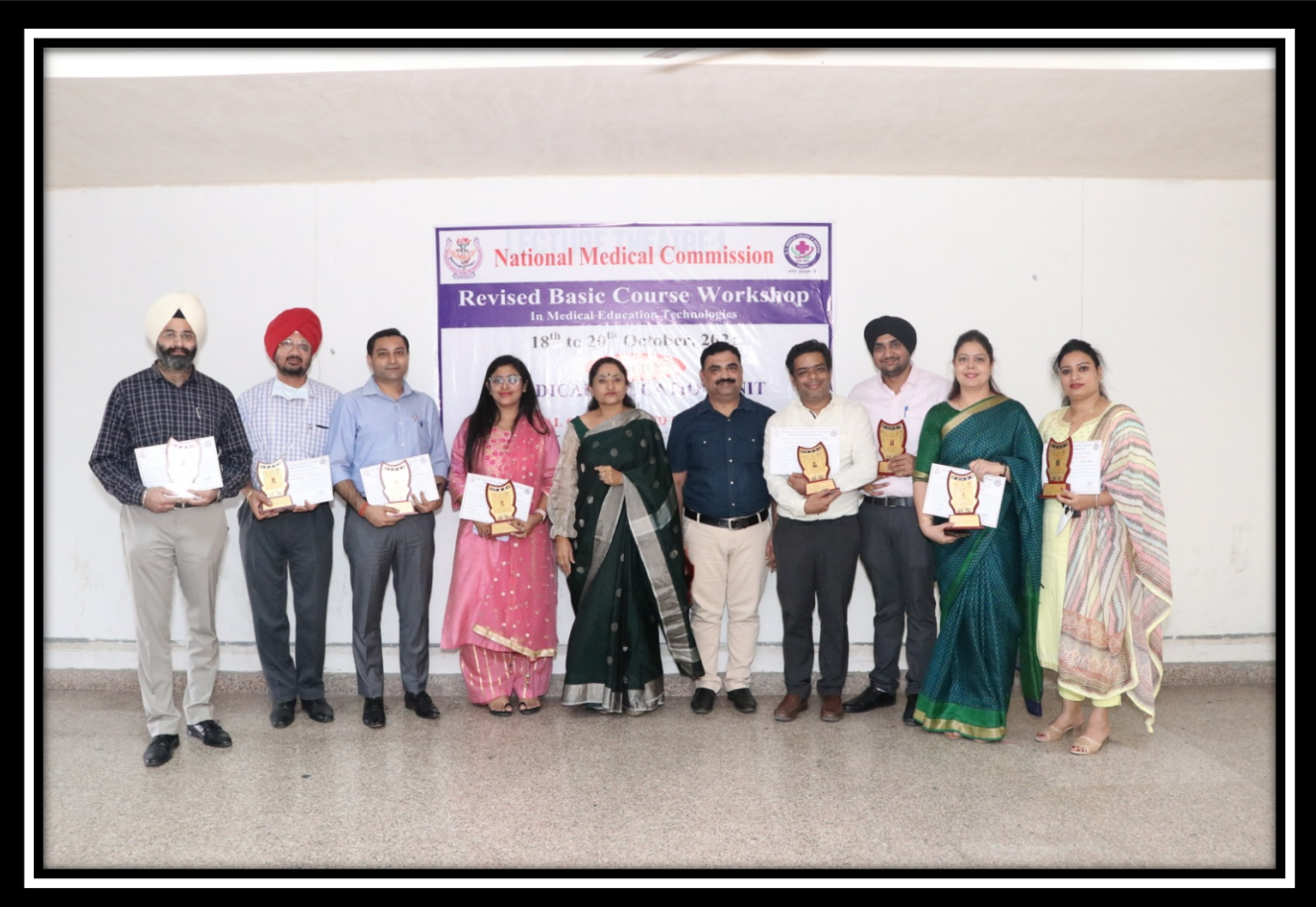
Page 32 of 10