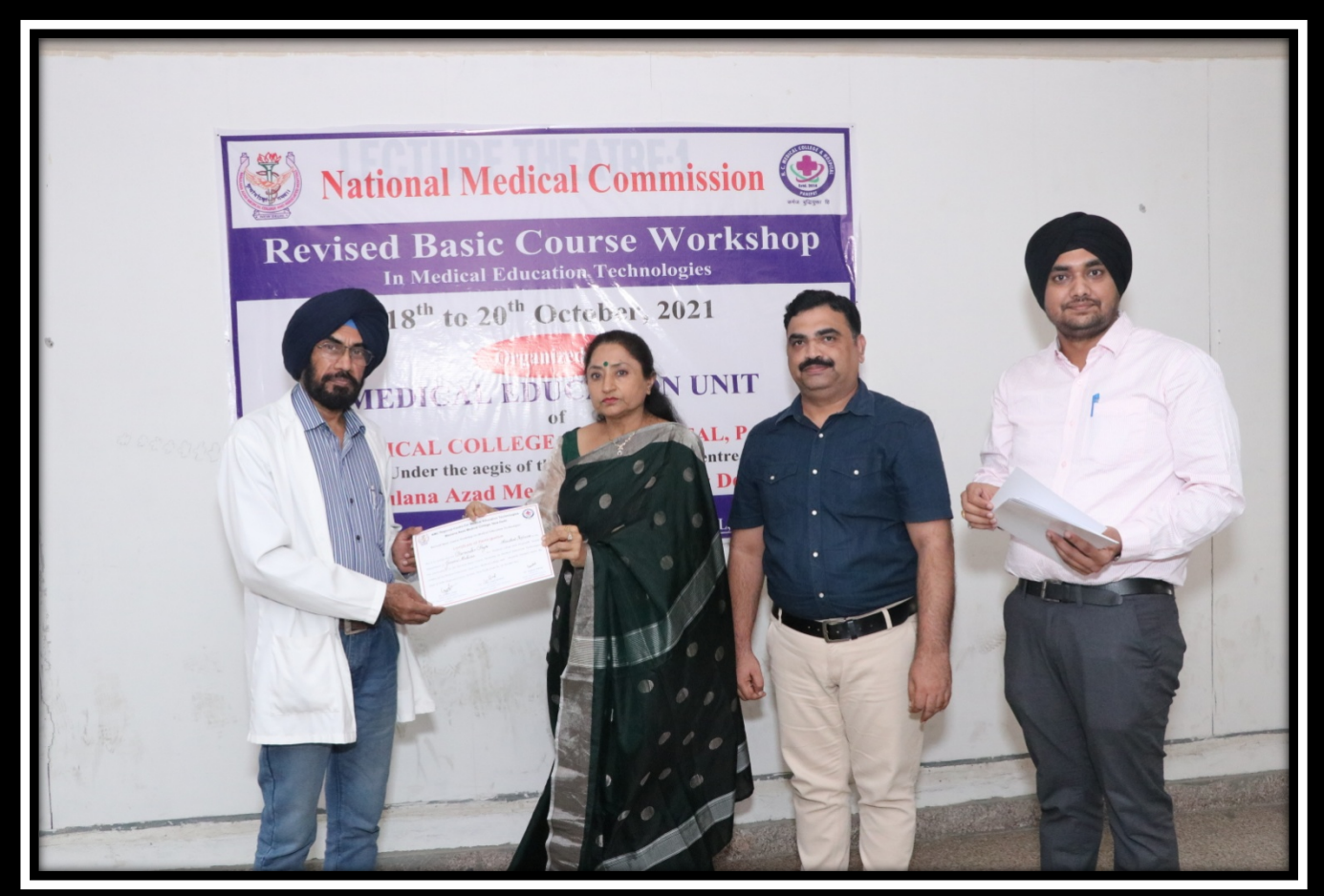
Page 21 of 10