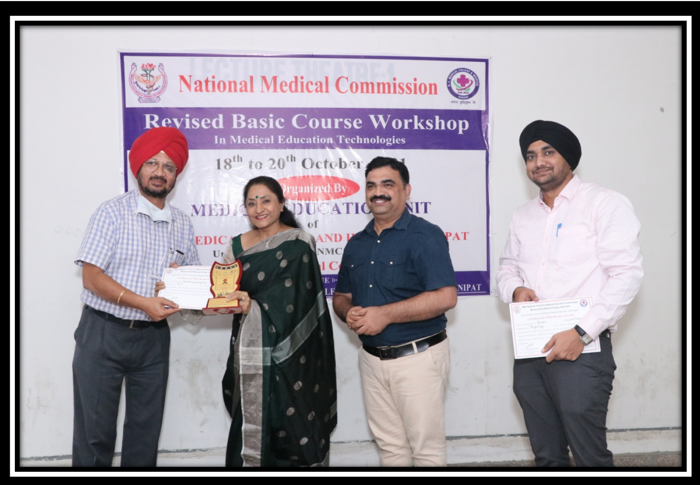
Page 29 of 10