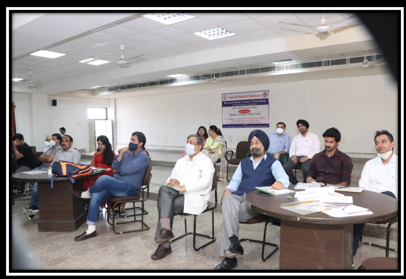
Page 12 of 10