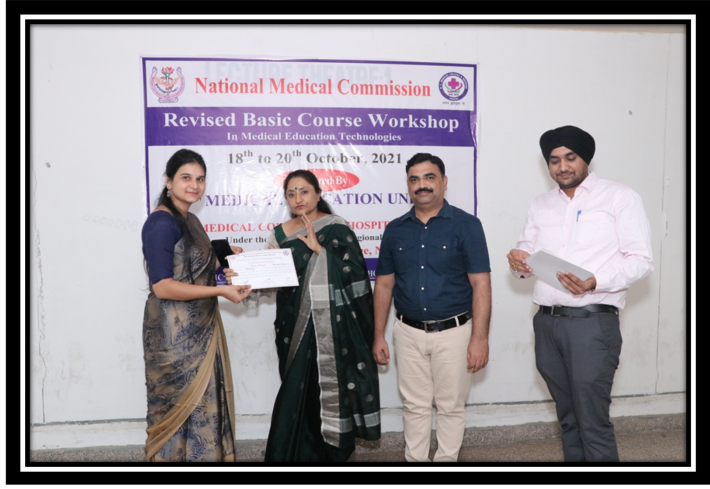
Page 22 of 10