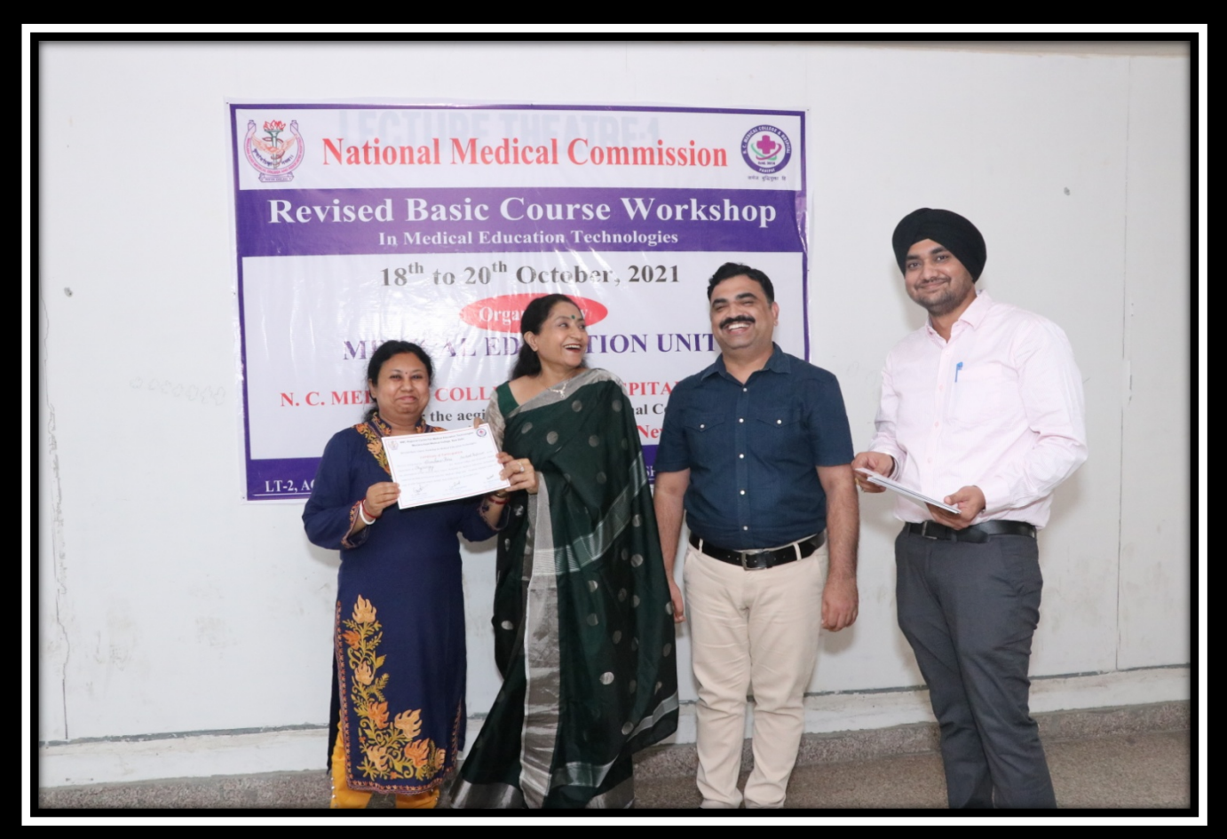
Page 23 of 10