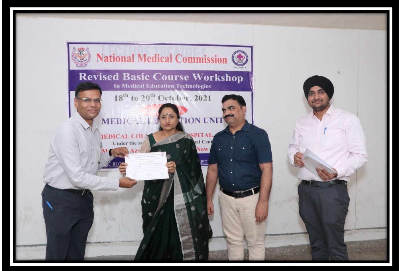
Page 19 of 10