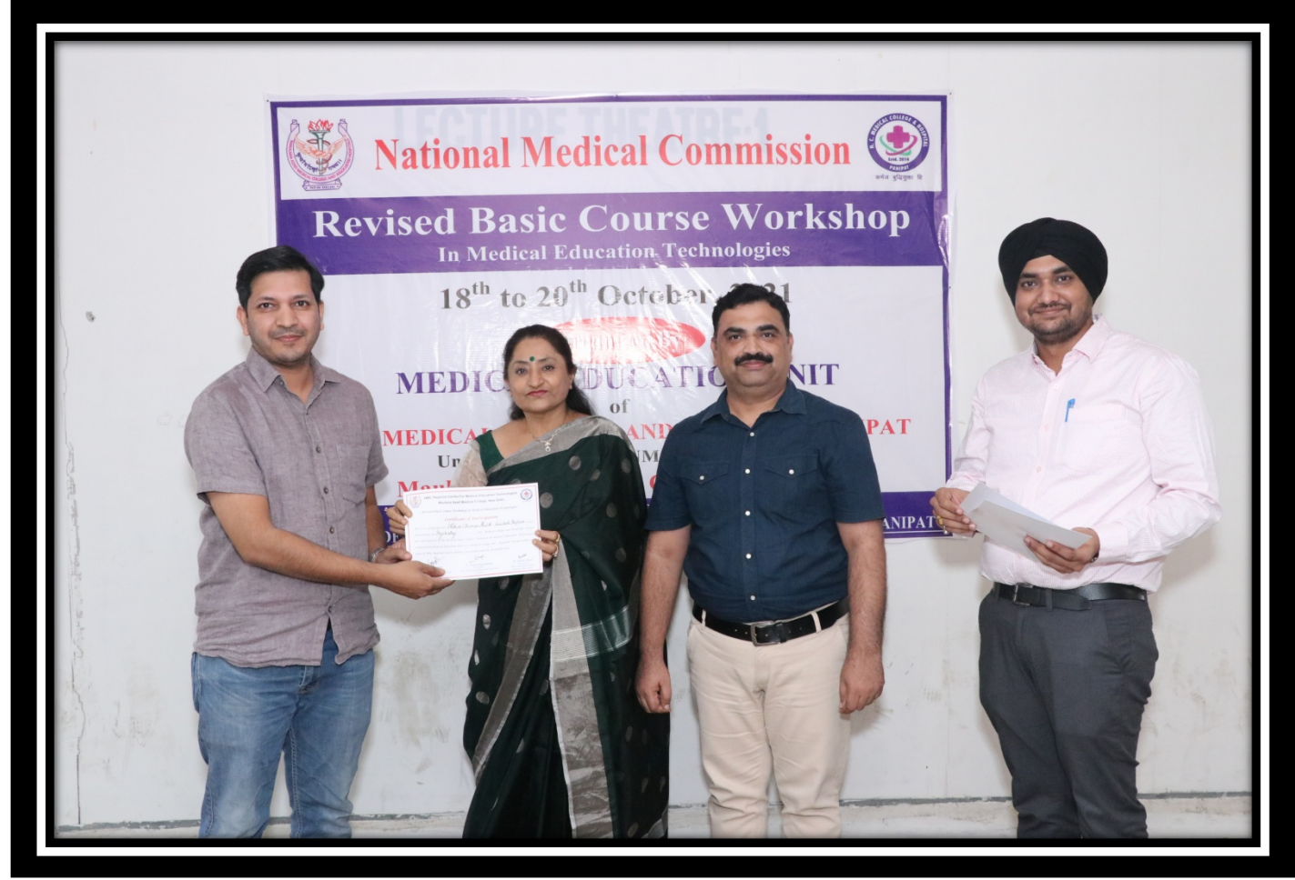
Page 26 of 10