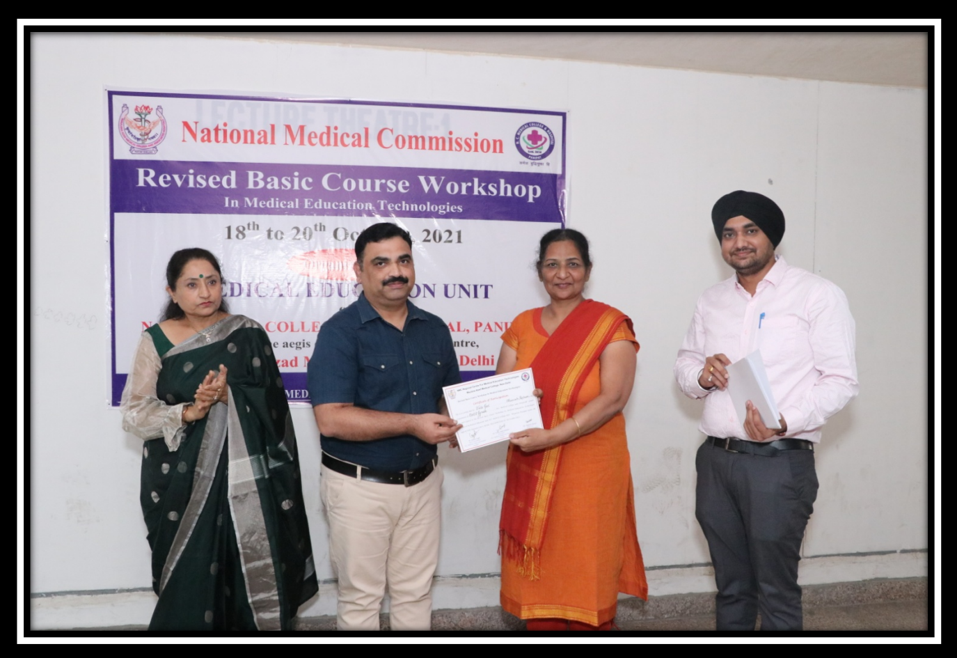
Page 17 of 10